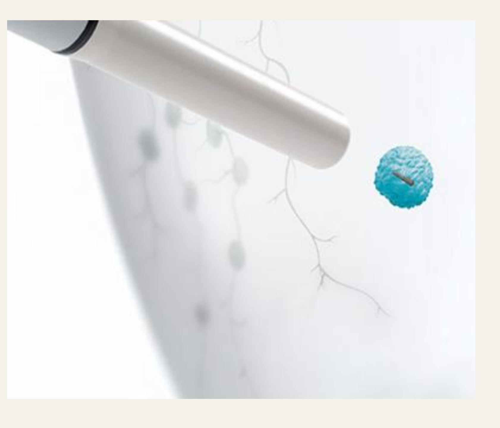
Figure 3 Diagrammatic Image of probe detecting Magseed sited within a cancer

All Magseed's were easily detected by the probe in theatre.