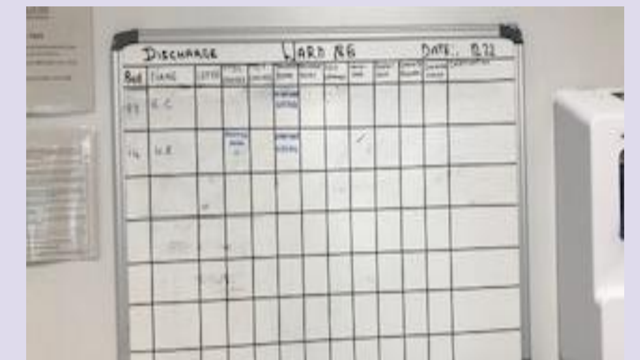
A picture of Ward 27 Production board to pinch with pride and get useful ideas

Currently Ward 18 colleagues are not always aware of the flow of their patients due to not having a visual reminder, such as a PSAG board, or Production Board. Important information, such as provision of TTOs, booking of transport, are not always known, resulting in re-work of having to constantly chase up. As a result, this has been known to cause delays to discharge.