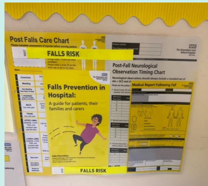
Information on the wall above the trolley.

The team moved the trolley from the end of ward to the nurse's station. In addition, they included information above the trolley about the policies and procedures.