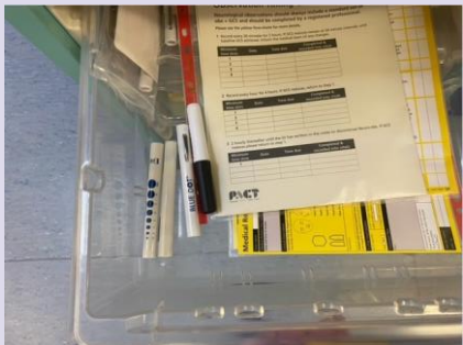
Drawer containing charts and pen torches.

To introduce a falls trolley which contains everything they need to identify patients at risk as well as the information and equipment needed to complete neurological observations. This was done at the end of March 2024.